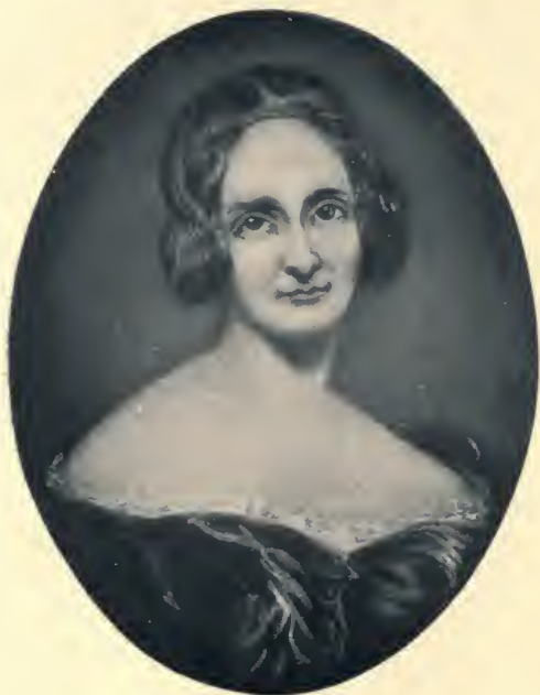
MARY W. SHELLEY.